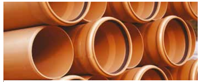
Solid Wall Sewer Pipe