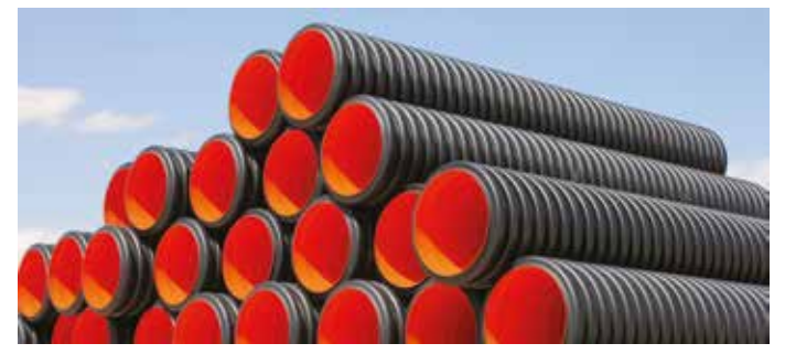
Structured Wall Sewer Pipe