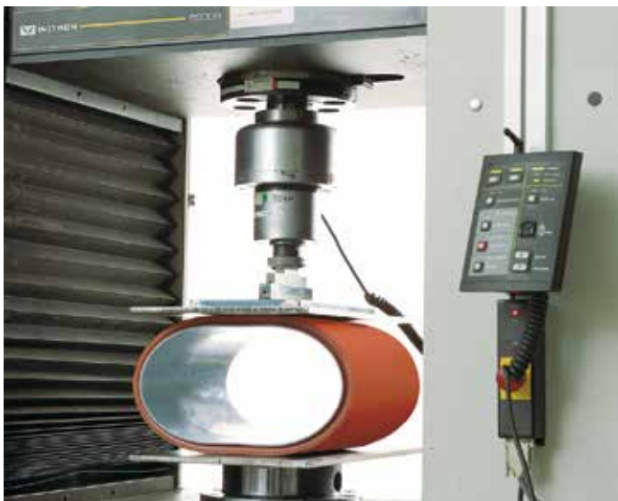
Laboratory Test for measuring pipe stiffness

With the introduction of a range of European Product Standards for different types and